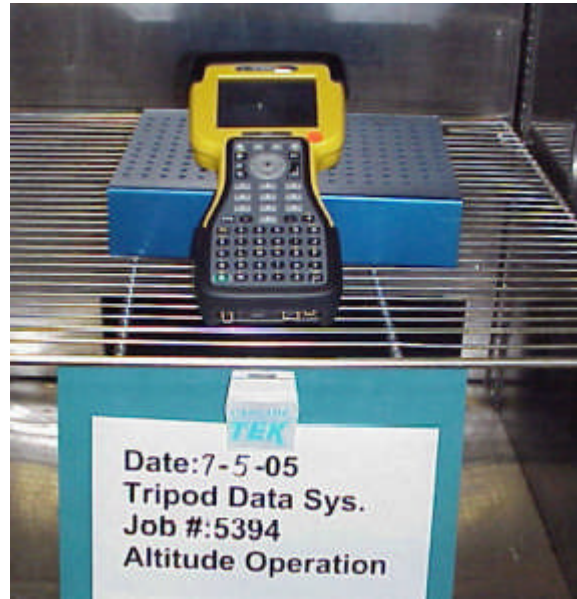
Figure 2—MIL-STD-810F Method 500.4 low-pressure test

(8,000 ft.) and stabilized for 15 minutes. They are then exposed to a simulated altitude of 12 192 meters (40,000 ft.) in 15 seconds or less. The units are held at 12 192 meters (40,000 ft.) for 10 minutes. Finally, the units are returned to the site altitude and are subject to a test of all standard functions.