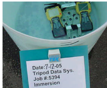
Figure 4—MIL-STD-810F Method 512.4, immersion test

Sample units are immersed for 30 minutes. The lowest point of the sample units is 1 meter below the water surface.