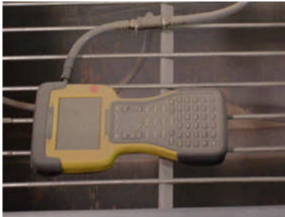
Figure 3—MIL-STD-810F Method 510.4, sand and dust test